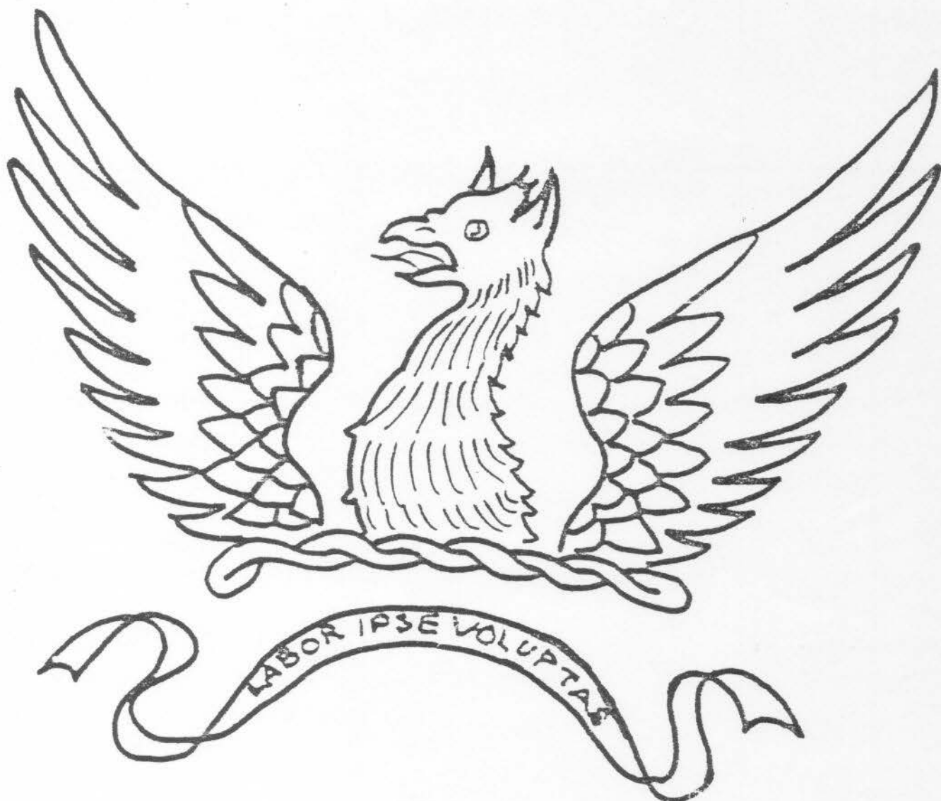
JANVRIN FAMILY CREST (The Phoenix)